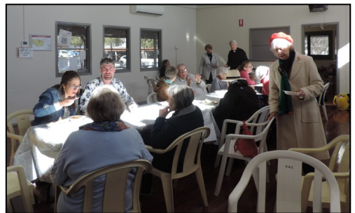
Everyone enjoys a festive luncheon following Sunday Mass