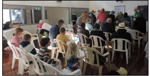
The people receive Holy Communion during Sunday Mass

May they be fruitful and yield an abundant harvest.